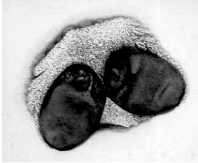
Fig. 3 Microorganisms identified tentatively as Flavobacterium oryzihabitans grown in extraterrestrial nutrient extracted from the Murchison meteorite, with a meteorite fragment in the background.

alteration phase, and in dust-sealed comets if they contain sub-surface water when warmed to 280-380 K during perihelion transits [27]. After landing, microorganisms can use the meteorite matrix materials. In fact, water in fissures in carbonaceous meteorites can create concentrated organic and mineral nutrient solutions conducive to prebiotic synthesis, and provide early nutrients after life arose in these meteorite microenvironments [19].